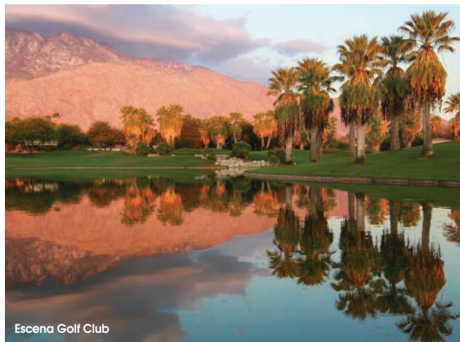
Escena Golf Club