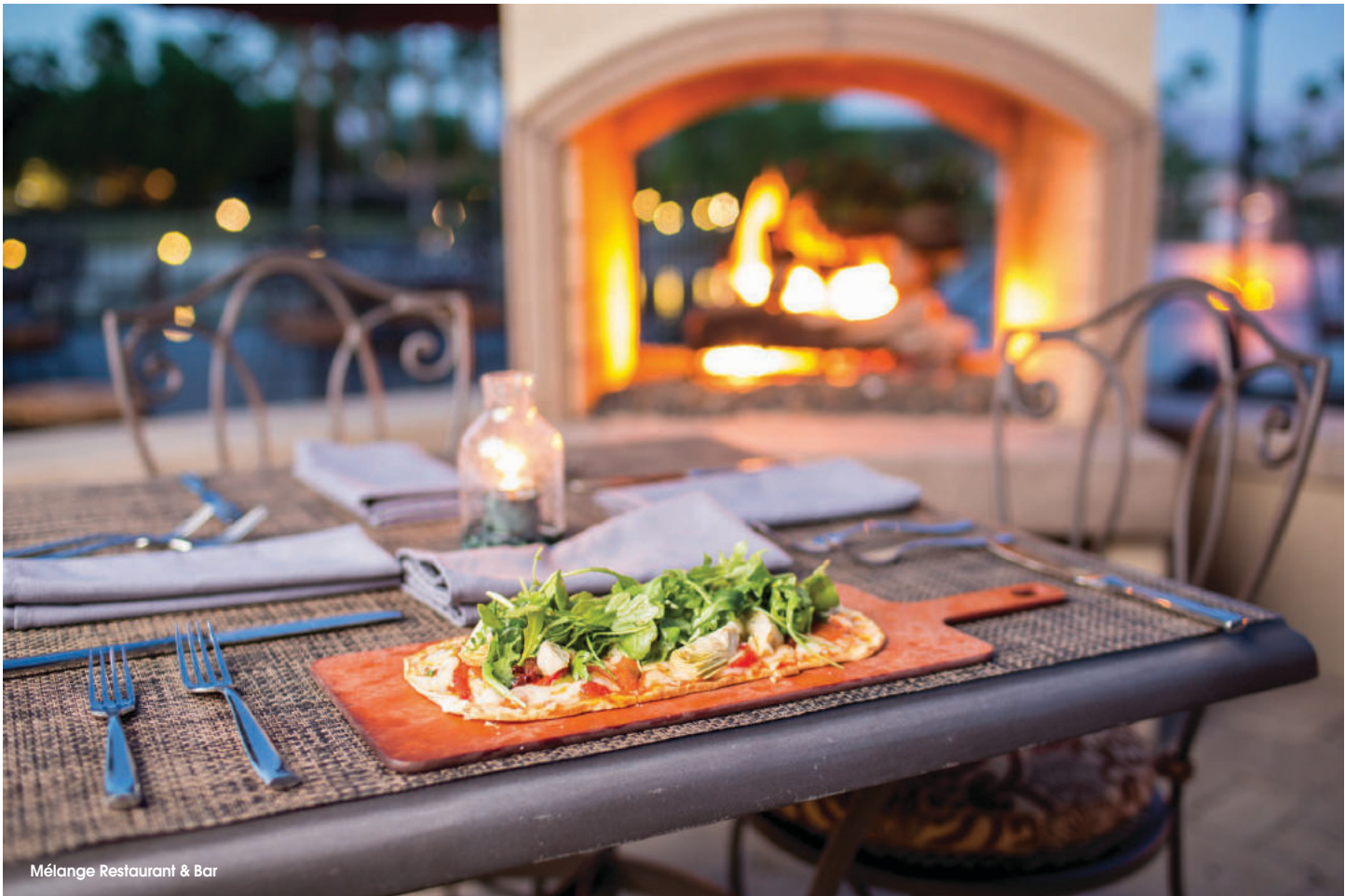
Mélange Restaurant & Bar