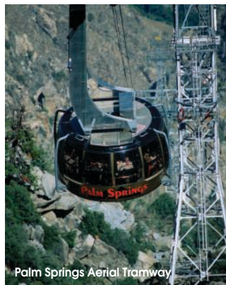
Palm Springs Aerial Tramway

And after a long desert hike, make a pit stop for a well-deserved date shake at kitschy Shield's Date Farm in nearby Indio. Don't feel the need to pay for the walking tour. Just grab a couple of shakes (you won't want to share), take a few of the plentiful samples at the store, and head out to your next desert destination.